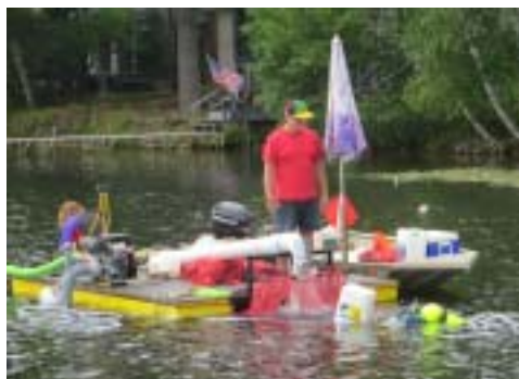
The two divers and volunteer using the hookah air supply and suction of the barge DASH system.

system with one diver using hand harvesting during the 14 hours. A total of 28 pounds of EWM was harvested. No non-targeted plants were removed during the DASH operation. Diver time also included searching for other EWM plants and more were experienced. This effort no doubt increased the man-hours, but since DASH was contracted for the day, extra effort was made to locate and remove additional EWM plants. The full report can be found on the Lakes District's web page ( http://www.crookedlakewi.com/ ).