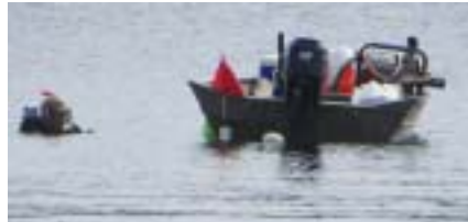
The single diver using the hand harvesting technique on Crooked Lake.

Diver Assisted Suction Harvest (DASH) of Eurasian Water Milfoil (EWM) took place July 28, 2015, on Crooked and Bass lakes. A survey performed on June 4 reconfirmed the locations of EWM and 0.14 acres were targeted in Crooked Lake and 0.11 in Bass Lake. There were three divers and one volunteer. Two divers used the hookah air supply and suction of the barge DASH